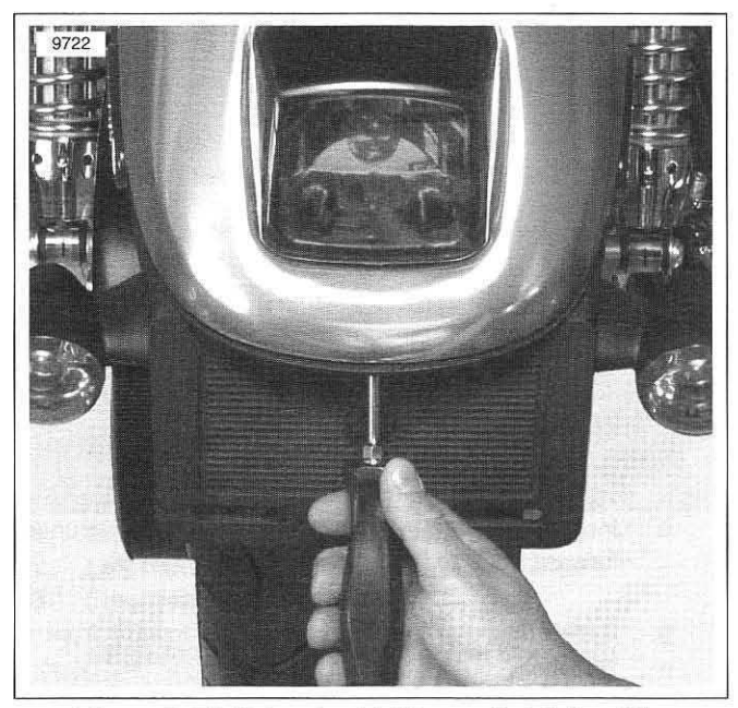
Figure 8-24. Releasing Tail Lamp Retaining Clip